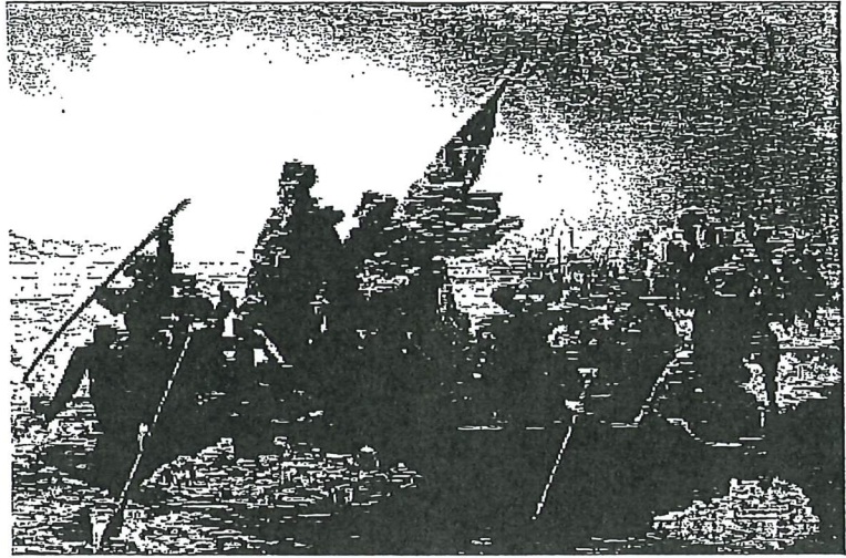
In 1851, Emanuel Leutze painted this picture of Washington and his troops crossing the Delaware River.

It was a major victory for the American Continental Army and it raised their morale.