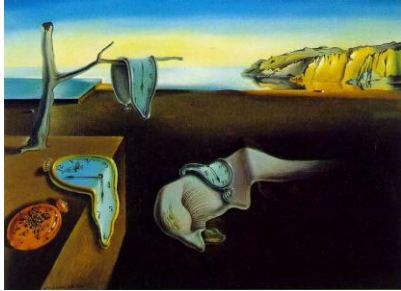
Salvador Dali "Melting Clocks"