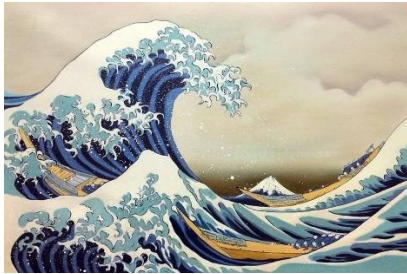
Katushika Hokusai “The Great Wave off Kanagawa”

What do you already know about the following work? If you know nothing about it, what do you see in it, and what style of art do you think it is? Also what materials do you think were used to make it?