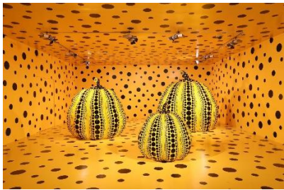
Yayoi Kusama "A Dream I Dreamed"