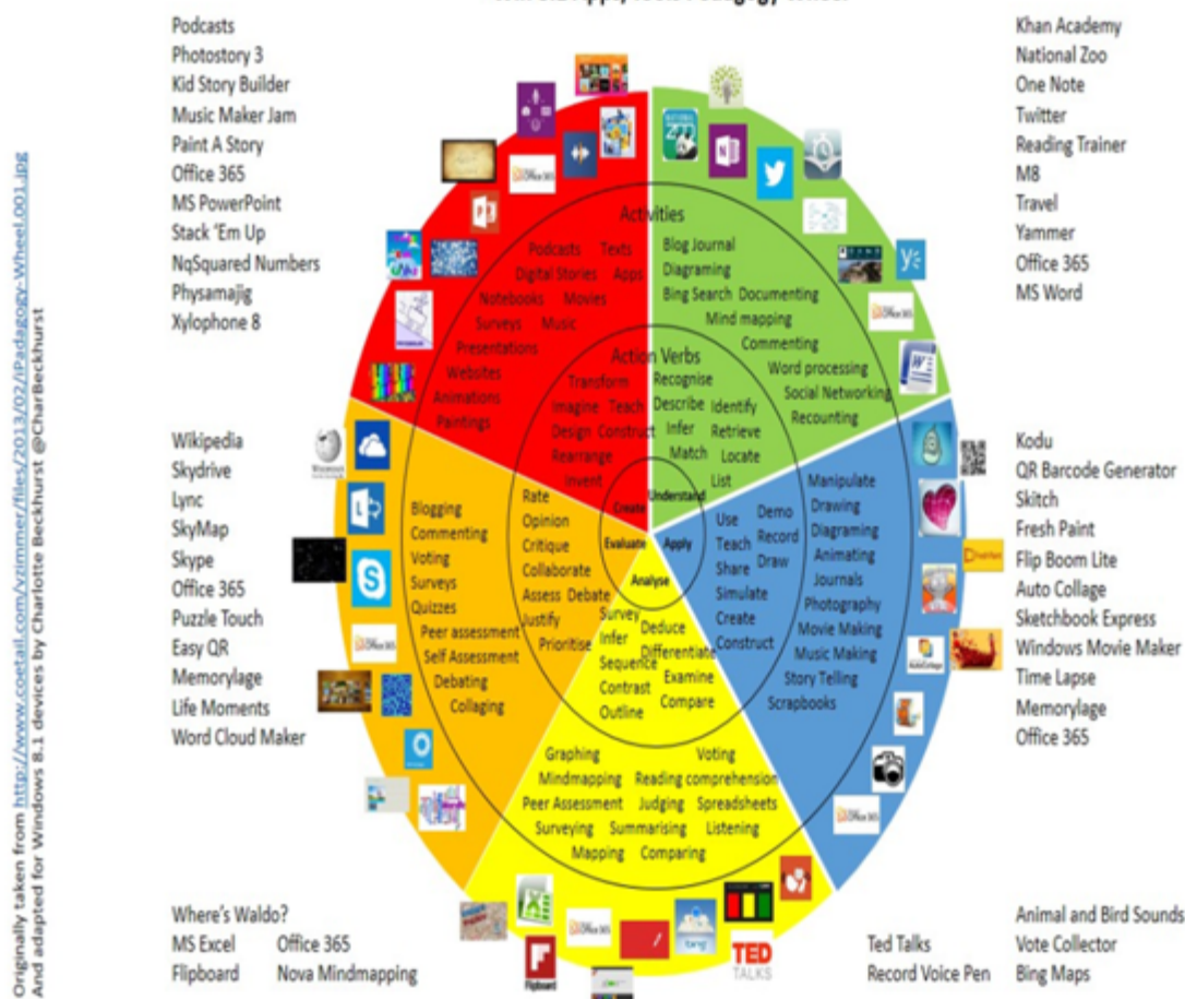
Win 8.1 Apps/Tools Pedagogy Wheel