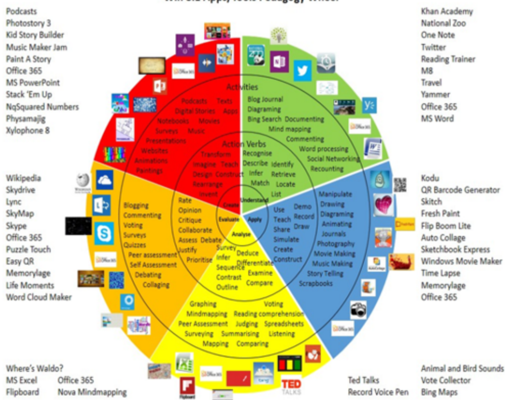
Win 8.1 Apps/Tools Pedagogy Wheel