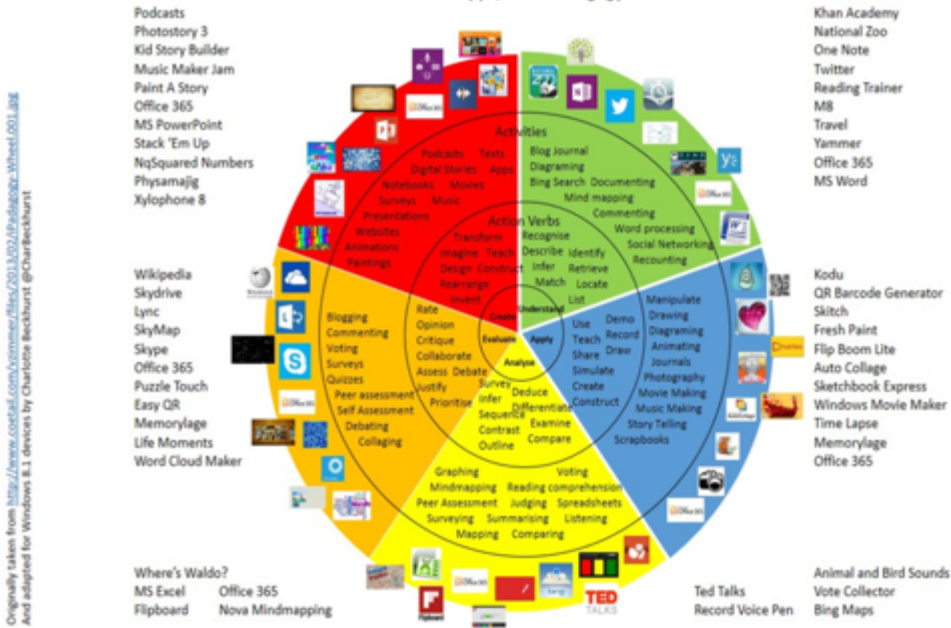
Win 8.1 Apps/Tools Pedagogy Wheel