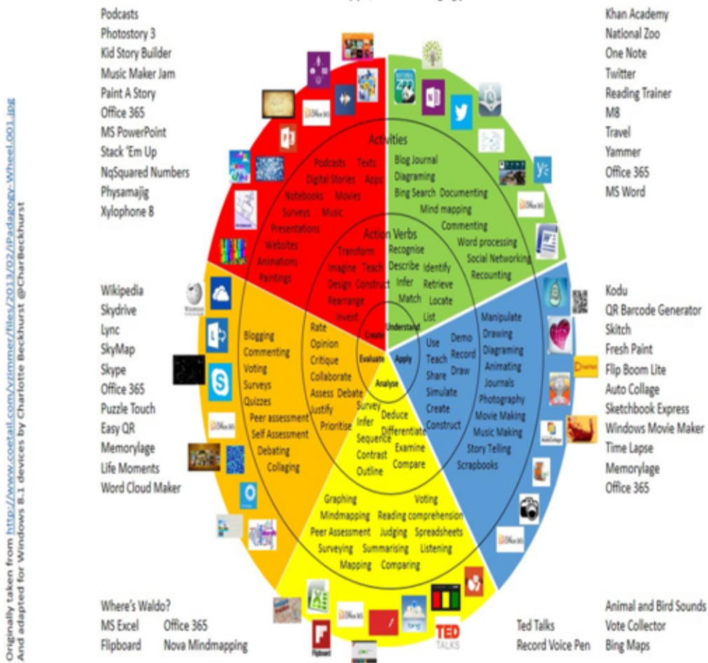
Win 8.1 Apps/Tools Pedagogy Wheel