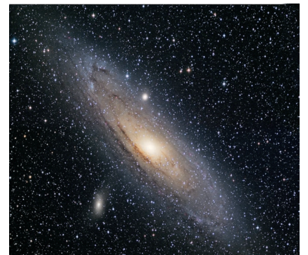
The Andromeda galaxy, M31