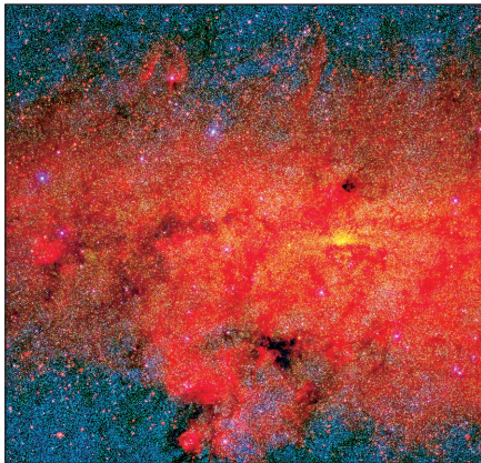
The view toward the center of the Milky Way

Galaxies come in many shapes and sizes. Our Milky Way is a spiral galaxy, which looks like a pinwheel with arms of stars, gas, and dust. You can make your own Milky Way galaxy with materials you can find at a craft store. Before you begin this activity, review the section Galaxies: Cities of Stars and look for key information about our galaxy.