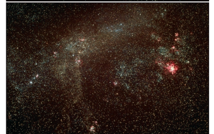
Small (top) and Large Magellanic Clouds