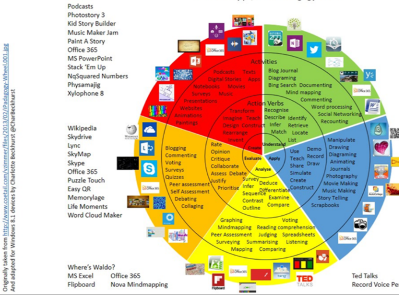
Win 8.1 Apps/Tools Pedagogy Wheel