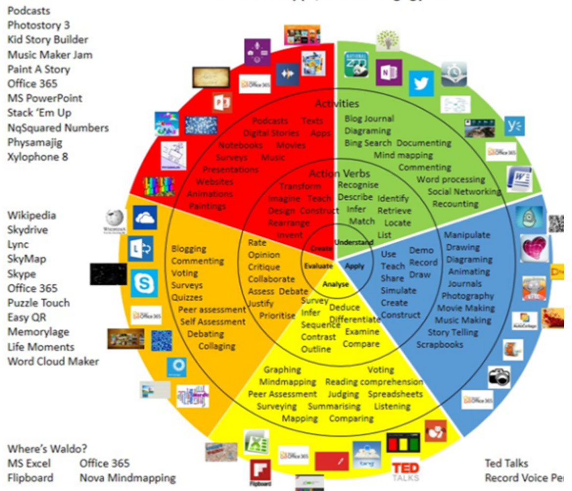
Win 8.1 Apps/Tools Pedagogy Wheel

And adapted for Windows 8.1 devices by Charlotte Beckhurst @CharBeckhurst