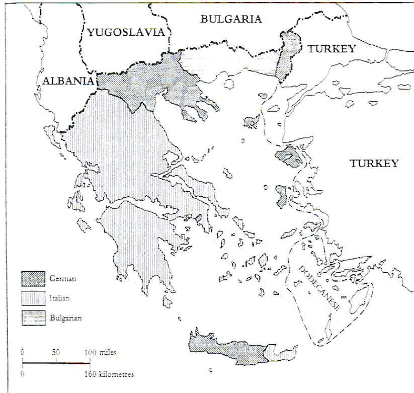
Zones of Occupation in Greece, 1941

Taken from: Inside Hitler's Greece by Mark Mazower p.21