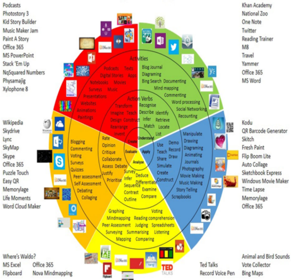
Win 8.1 Apps/Tools Pedagogy Wheel

And adapted for Windows 8.1 devices by Charlotte Beckhurst @CharBeckhurst