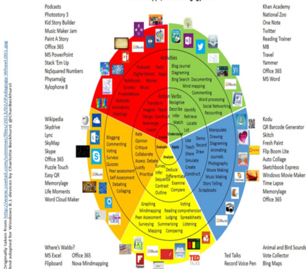
Win 8.1 Apps/Tools Pedagogy Wheel