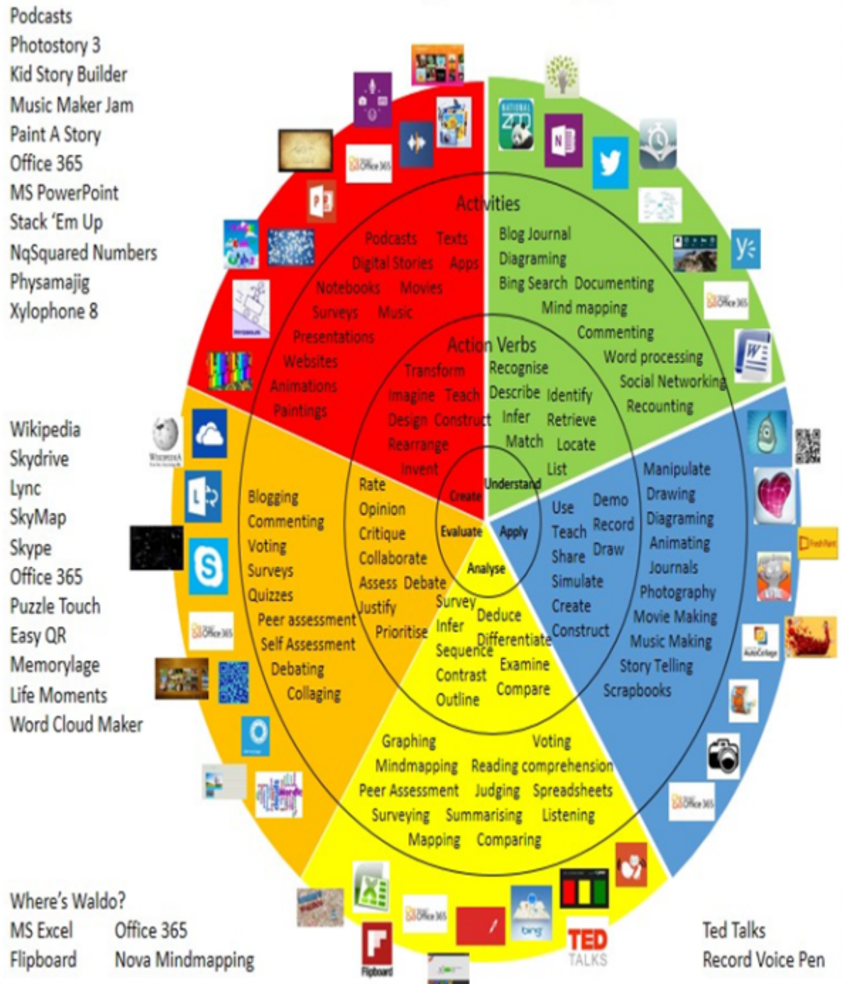
Win 8.1 Apps/Tools Pedagogy Wheel

And adapted for Windows 8.1 devices by Charlotte Beckhurst @CharBeckhurst