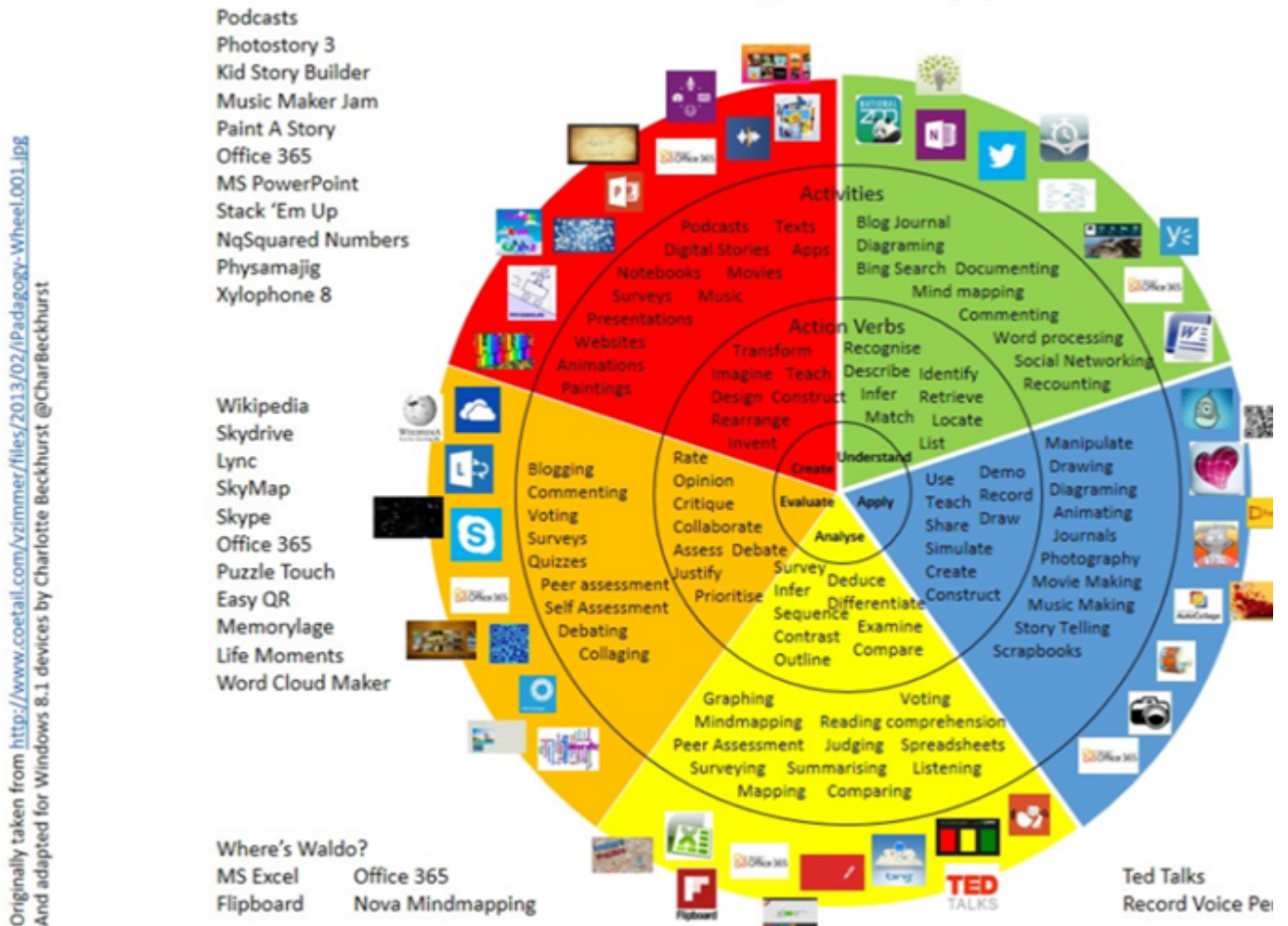
Win 8.1 Apps/Tools Pedagogy Wheel